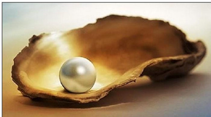
The pearl of great price

In this weekend's gospel, Jesus gives three parables concerning the Kingdom. In the first two, the person who discovers the hidden treasure, or the pearl, lets go of everything else in their life in order to have what they have found because they realise its value which surpasses everything else they have. These little stories are reminders that there is nothing in this world comparable to the Kingdom – everything else is passing and cannot be taken with us when we die. The Kingdom is eternal and is a place of happiness and peace lived in the presence of the Lord. Therefore, we must take every opportunity to secure our place in the Kingdom, even if that means letting go of everything else in life, including life itself. The message is that the way to the Kingdom is through wisdom and not through riches. The first reading gives us the moment when God appeared to Solomon and told the new king to ask for anything he wanted. Where most people would have asked for wealth and victories, Solomon asked for wisdom, and this won him God's favour.